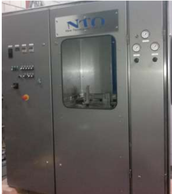
Example picture of NTO-3030 machine

Easy accessibility to clean the solder, maintenance friendly, simple operating, easy acces to the removeable solder pump. HASL NTO-3030LFS is an electrical controlled version.