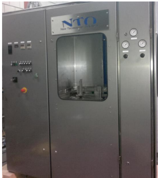
Example picture of NTO-1818 machine

Easy accessibility to clean the solder, maintenance friendly, simple operating, easy acces to the removeable solder pump. Available only as electrical/pneumatic controlled version.